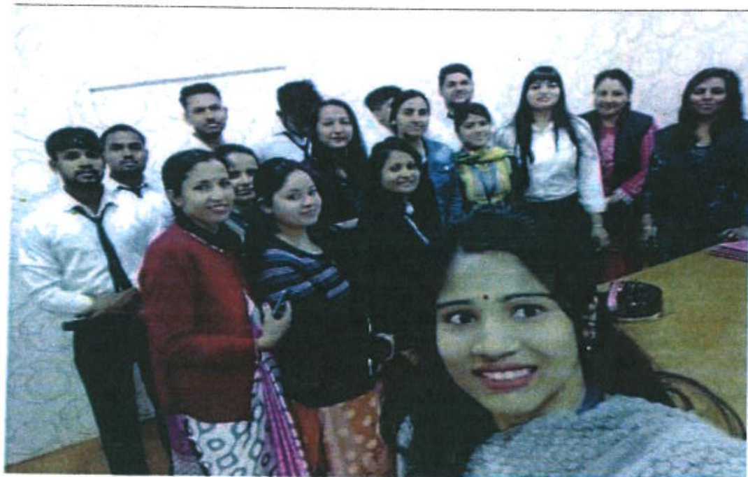
Women's day celebration

recognize the challenges that lie ahead. By continuing to advocate for women's rights and gender equality, we can create a more inclusive and equitable world for all.