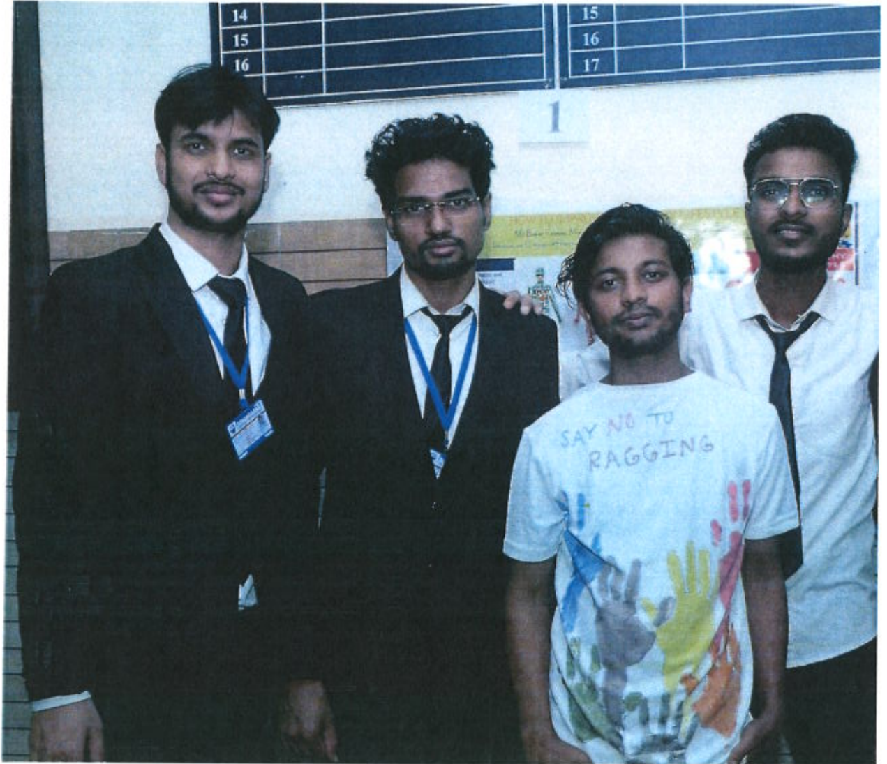
T-Shirt Painting Competition